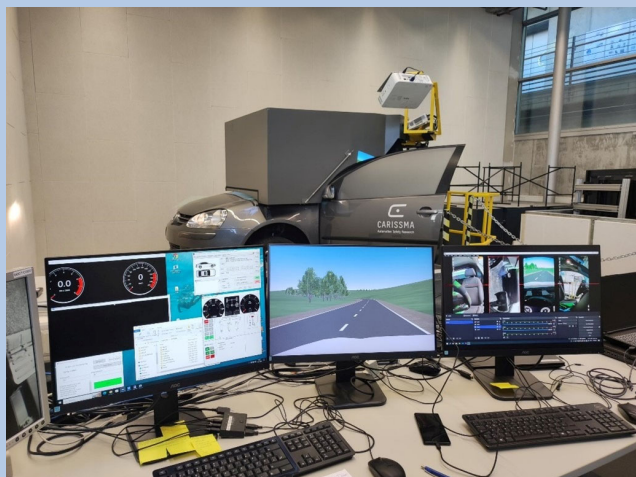
Fig. 5: Driving simulator (Hexapode in C 020)

From a legal perspective, the driver is responsible for vehicle control even when a driver assistance system is activated, which the manufacturers also emphasize in a continuous loop. The test results showed that the events occurred in quick succession. However, it is assumed that the driver can recognize and control the occurrence of the hazardous situation in advance, thus enabling a safe continuation of the journey. Literature research showed that so far, no basic data on the controllability of false-negative and false-positive activities of ADAS by the driver exists that could be used in accident reconstruction. To gain insights into the driver's reaction behavior and reaction times during such critical driving situations, a driving simulator study was conducted in February 2023 in an inter-institute collaboration between the teams of Prof. Schweiger and Prof. Riener (see Figure 5 for an example). The implementation was preceded by a planning and design phase of about one year. The test data will be analyzed and published in the summer.