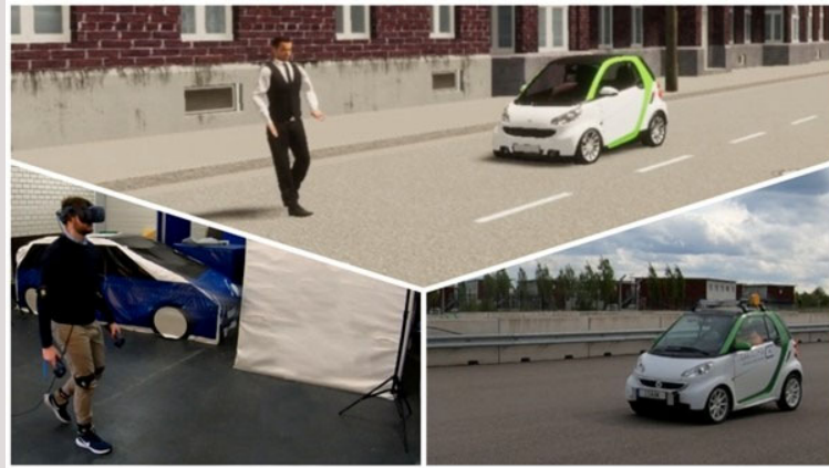
Fig. 3: Illustration of a driving test in a mixed reality test environment. The relative positioning of objects is difficult. Test automation is currently not possible.

The abstraction of positioning systems and the automation of the test infrastructure for mixed-reality driving scenarios will create a new possibility to efficiently and flexibly test a wide variety of critical driving situations. These can then not only be carried out on the outside or in the test hall, but can also be used, for example, for testing in parking garage entrances. By means of virtual shares, these tests can be carried out cost-effectively and with reduced hazards for people and material.