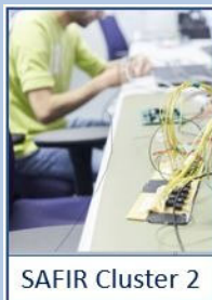
SAFIR Cluster 2