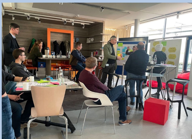
Fig. 1: Innovationsbarcamp