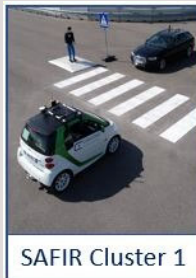
SAFIR Cluster 1